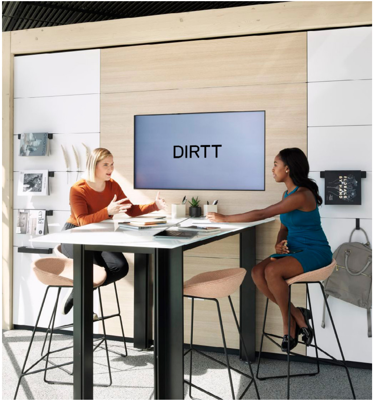
DIRTT EXPERIENCE CENTER Dallas, TX

DIRTT's most popular solid wall offers extensive options. No matter what finish, color, or configuration you specify, DIRTT wall systems can support your design with the performance and long-term durability you need. Use the space inside the wall cavity to add electrical and network functionality. Take the system further by integrating technology, graphics, writable surfaces, casework, and more. Quick, clean installs accelerate your timelines and with easy-to-remove panels, future maintenance and reconfiguration is just as fast.