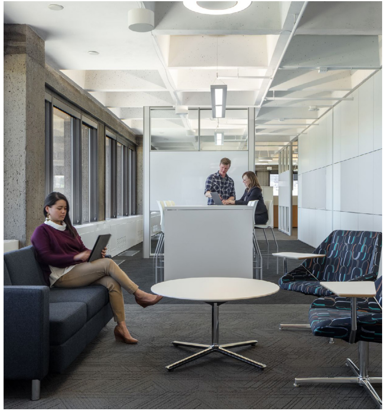
Denver Bureau of Reclamation Denver, CO

DIRTT's low-profile access floor houses all your electrical and technology infrastructure. This cost-effective option speeds up the overall installation of your DIRTT project. Long term, it keeps your electrical and IT infrastructure easily accessible allowing for easy moves, additions, and changes. With the agility of the DIRTT construction system, it's adaptability you can build on.