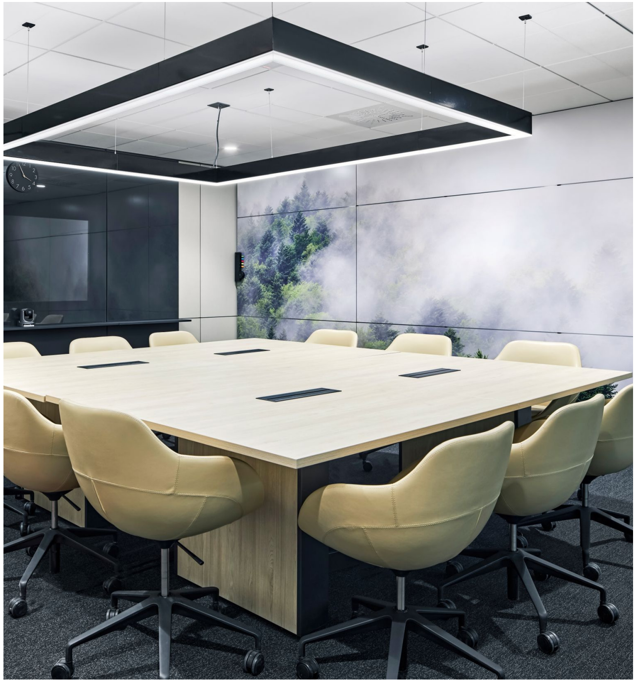
MINTO HEADQUARTERS Ottawa, ON

Want to maintain a consistent aesthetic across an entire space? Easily convert rough building shell conditions to your preferred aesthetic with DIRTT's Furring Wall. Get complete customization of wall finishes and materials that fit with your overall DIRTT scope thanks to elevated fit and durability of our precision-manufactured wall assemblies. Add additional spacing to the back of the assembly to accommodate MEP or base building conditions.